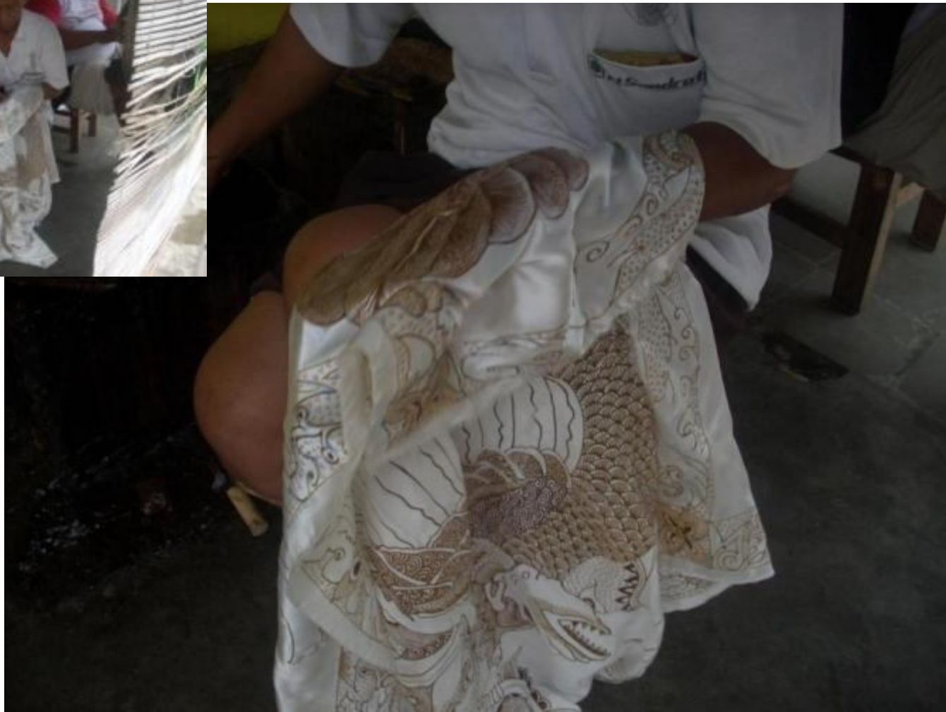
Crafts Batik, which the most famous goods from Yogyakarta