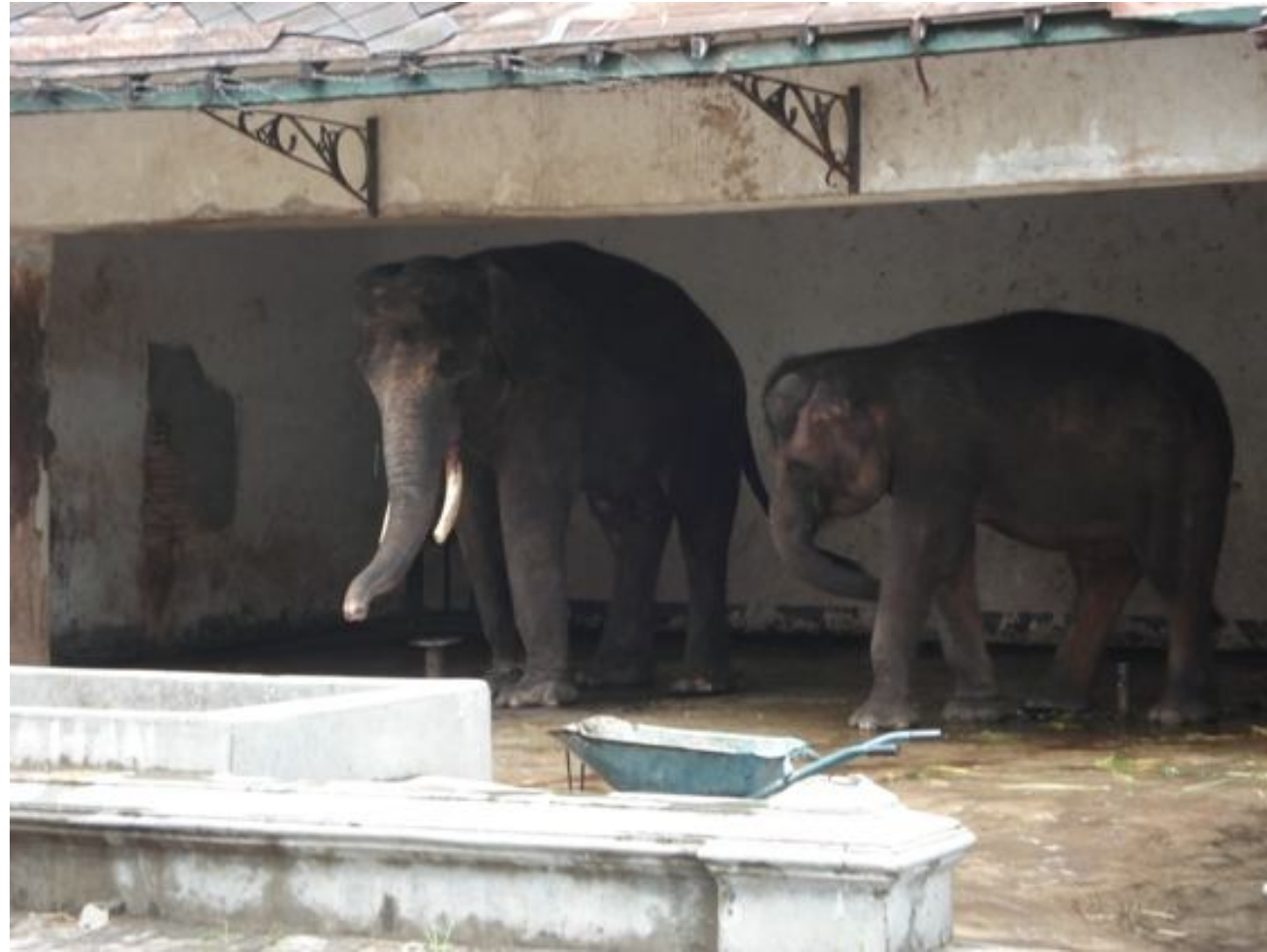
The Royal Elephants of Yogyakarta Palace