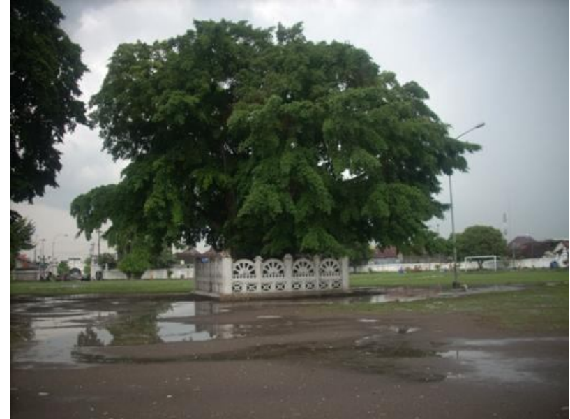
Beringin tree to the right from north