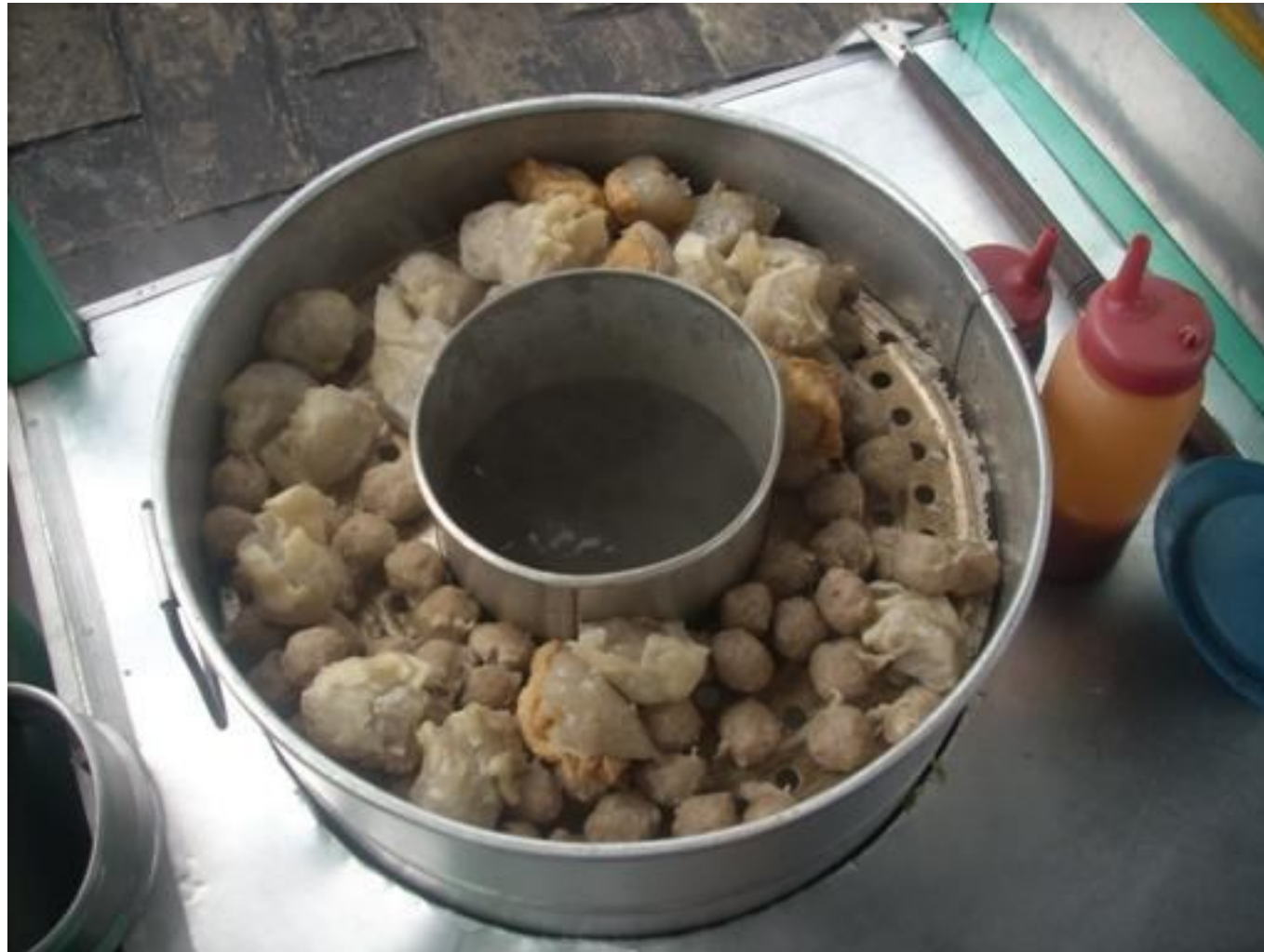
“Bakwan Kawi”, such a like a hot meals around of Alkid