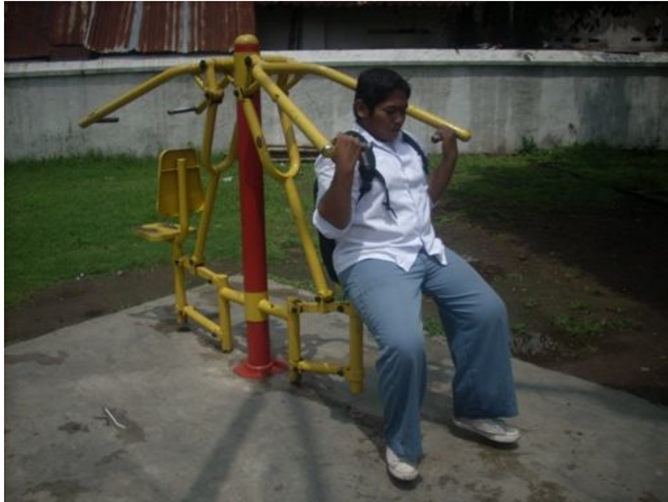
A student of a school in Yogyakarta trying to use Sport Public Service