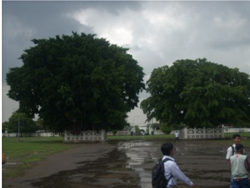
Two Beringin trees, which symbolizes the strength of palace life and the protection for the people