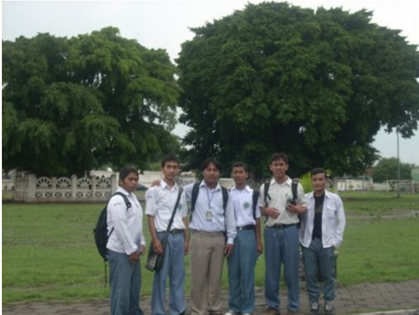
Alun-alun kidul [ALKID] Southern City Square