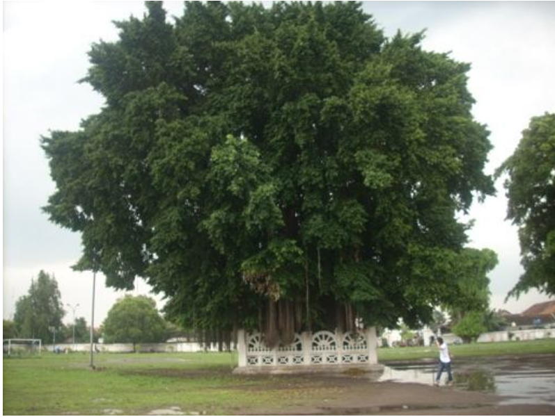
Beringin tree to the left form north