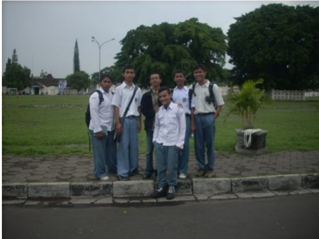
The Crews took a picture in Alkid. It was a great moment