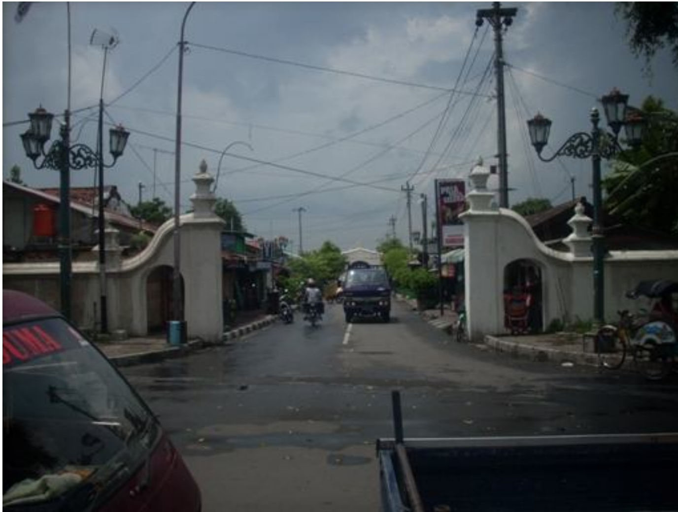
An Axis from Merapi Volcano-Jogja Kembali Monument-Yogyakarta Palace-Southern city Square-Kandang Menjangan-Parangtritis. The axis divided yogyakarta into two parts.