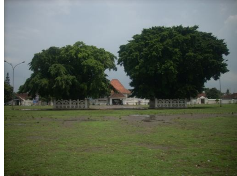
Beringin trees visible from the south, the building visible behind the trees is Sasono Hinggil